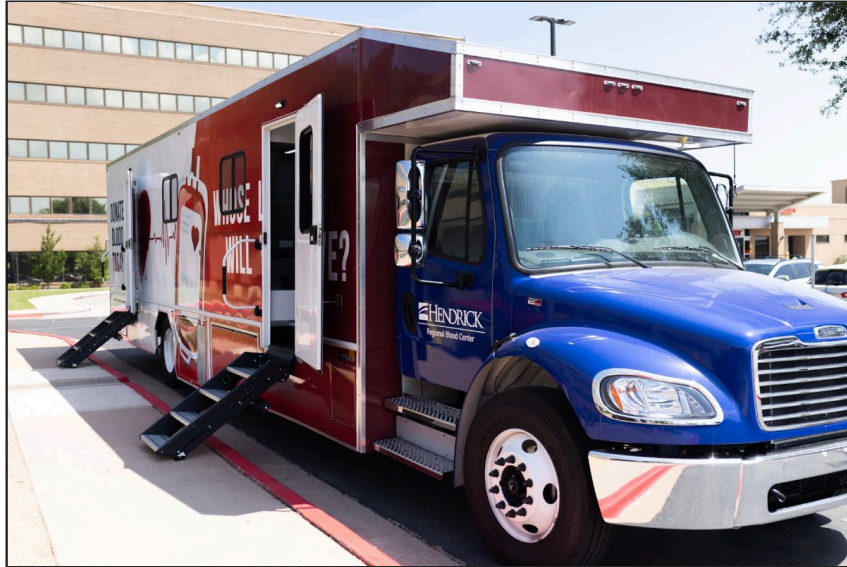
The new Hendrick Regional Blood Center blood mobile has the ability to accommodate double red cell donations.