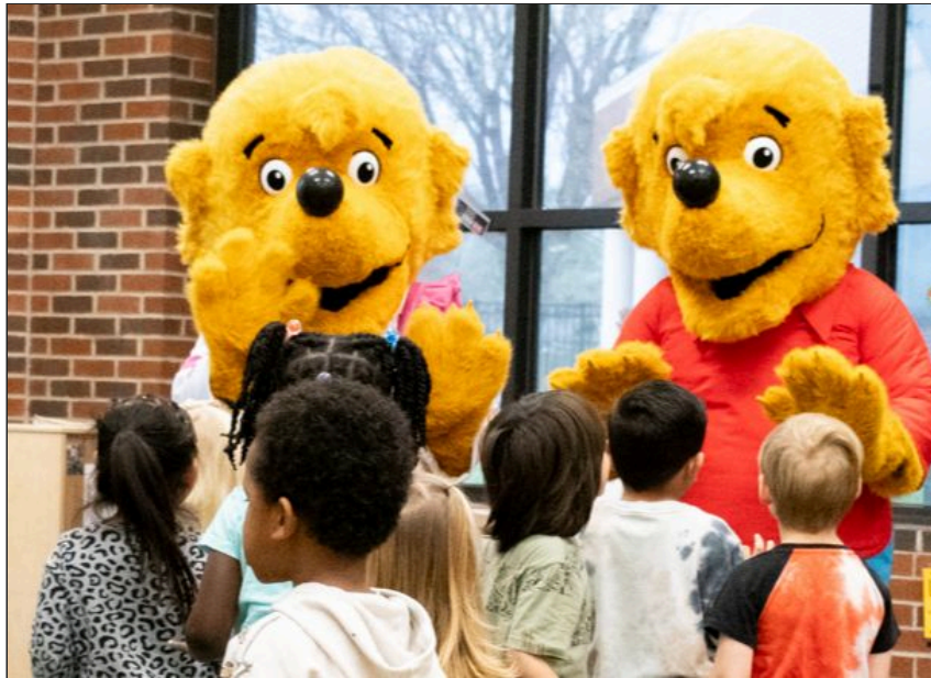
Hendrick Health pediatric healthcare ambassadors Brother Bear and Sister Bear from The Berenstain Bears book series visit with youngsters at Day Nursery of Abilene Orange Street Center to mark a partnership with United Way of Abilene supporting the local chapter of Dolly Parton's Imagination Library.