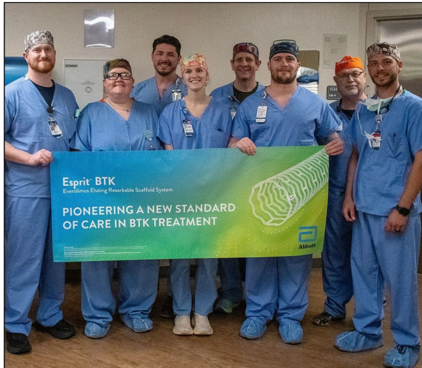
Pictured are members of the Hendrick Health surgery team involved in completing a procedure involving a new first-of-its-kind dissolvable stent for patients suffering with chronic limb-threatening ischemia below the knee.

The new stent technology, comprised of materials similar to dissolving sutures, is twice as effective compared to the current treatment options, and dissolves over time.