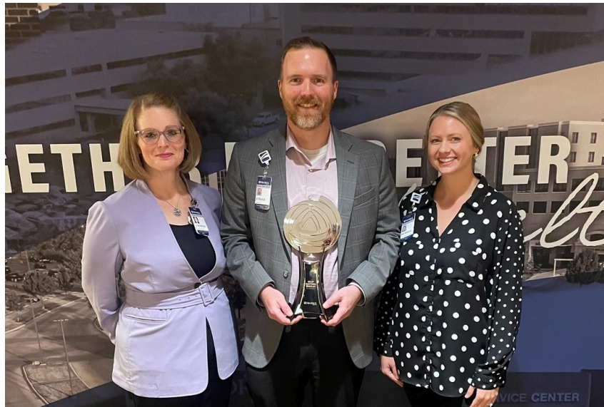
In 2024, Hendrick Health earned the Gallup Exceptional Workplace Award for the 18th consecutive year, the only healthcare organization in the world to achieve this track record.

Our community benefits from such an engaged workforce. Studies show that highly engage organizations excel in several important business outcomes, including customer ratings, productivity, turnover, safety incidents, absenteeism and well-being. Excelling in such benchmarks is important in the Hendrick Health vision to be the leading healthcare provider of choice in our region and beyond, recognized for enhancing quality, expanding access and excelling in patient engagement.