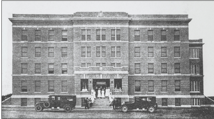
Hendrick Health began as West Texas Baptist Sanitarium on September 15, 1924.